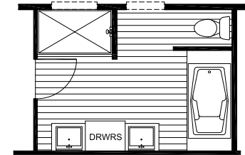
OPT BATH 2