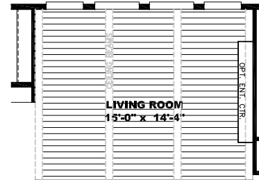
OPT. ENT. CTR. LOCATION