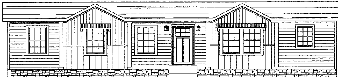
OPT. FRONT ELEVATION